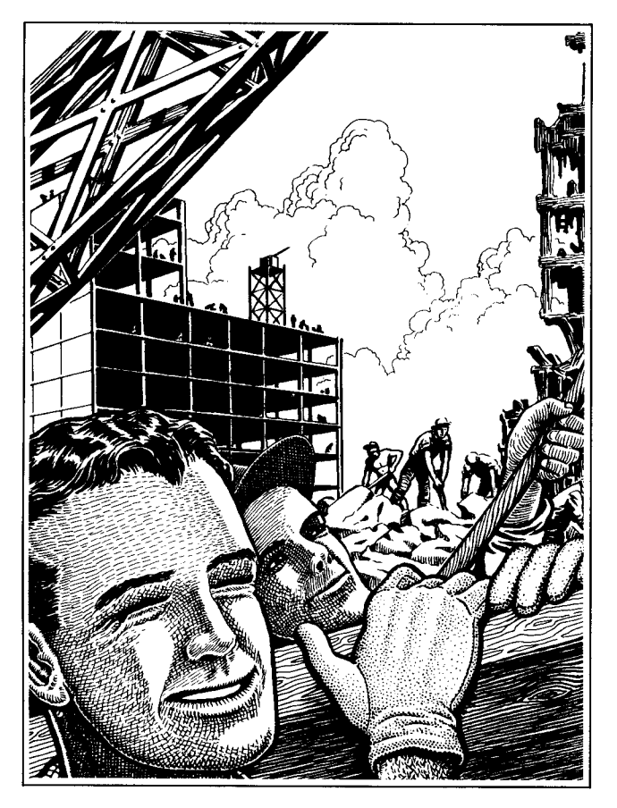
The devastated cities will be rebuilt after Jesus Christ returns to earth.

God will even change the natures of wild animals, as we find in Isaiah 11:6: "The