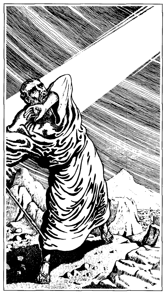
God fulfilled His promises to obedient Abraham by greatly blessing his modern-day descendants.

bestowed (Genesis 48). And as a careful study of history shows, the modern-day descendants of Ephraim and Manasseh—formerly the leading tribes of the house of Israel—are Britain and the United States today.